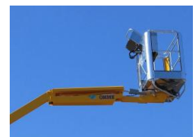
Fly jib (option)