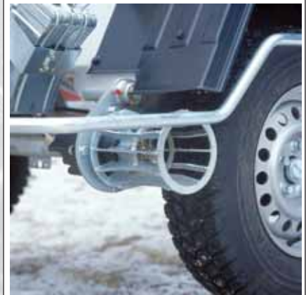
The hydraulic drive system enables the DINO I25T to be moved easily around site.

DINO® and Dino Lift® are trademarks registered by the company Dino Lift Oy.