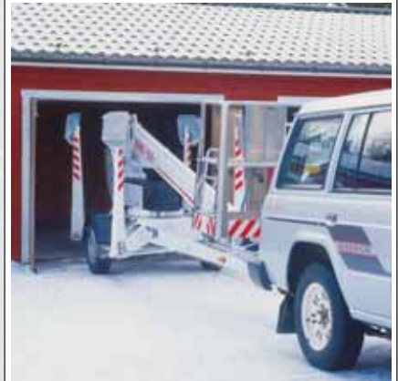
The compact design of the DINO I25T allows the machine to operate in confined areas.