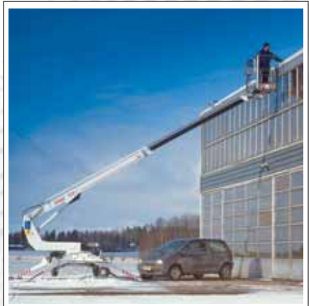
The rigid but lightweight design of the DINO I25T provides a maximum outreach of 8.3 m.